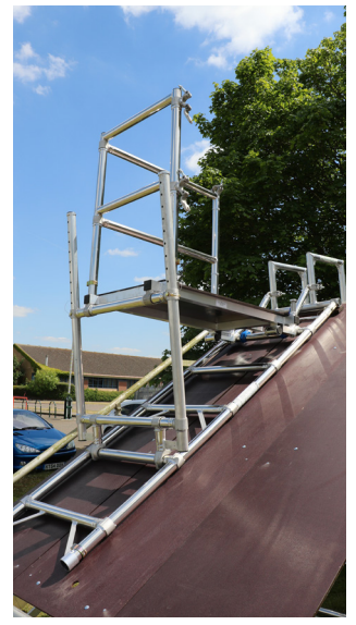
Fit your first handrail and engage the interlock clips