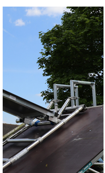
Position the platform on the appropriate rung of the frame at the top.