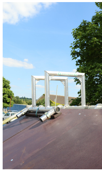
Place ridge unit over the ridge of the roof. Ensure that the wooden bearers are placed flat against the roof tiles.