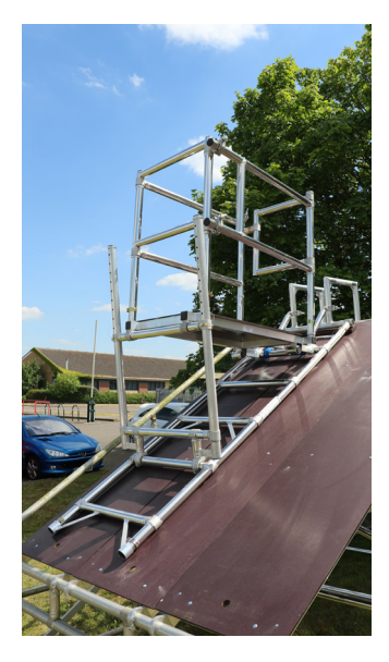
Fit your gated guardrail and engage the interlock clips. Make sure the gate opens inwards.