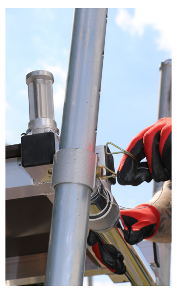
Remove the pins from the uprights by unclipping the pins. Level your platform and then engage the clips in the appropriate hole.