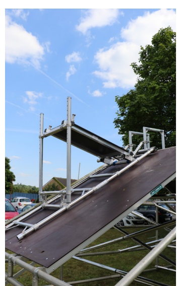
Then Unclip the bottom section from under the platform and clip onto the appropriate rung so that the uprights are leaning down towards the eve of the roof. Not towards the ridge.