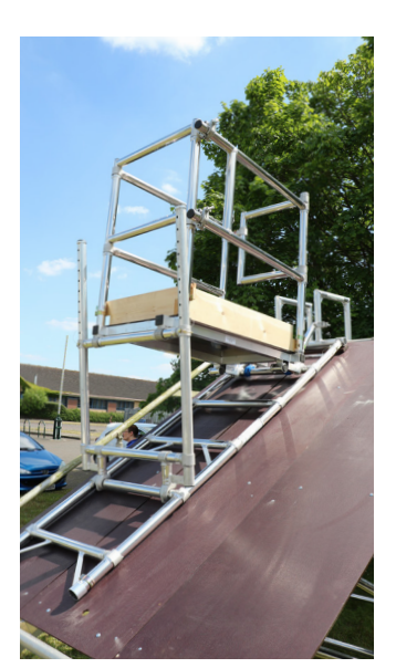
Fit your toeboard assembly by clipping it onto the uprights.