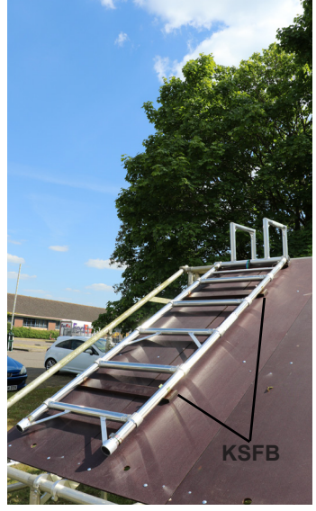
Fit the single width frame to the ridge unit by offering the spigots up to the ridge unit sockets, engage interlock clips.