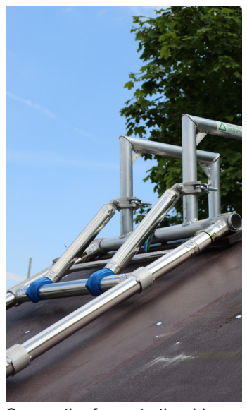
Secure the frame to the ridge unit with both frame connectors. Ensure the ridge unit is level and the coupler is fully tightened.