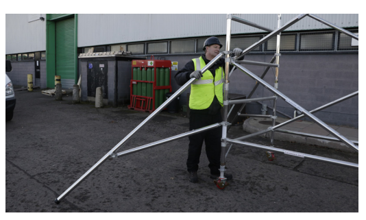
8. Fit the 4 stabilizers supplied with your tower. Note: Always fit 4 stabilizers unless building in a corner, inner stabilizers fit parallel to a wall. See kit list for correct size required to build your tower.