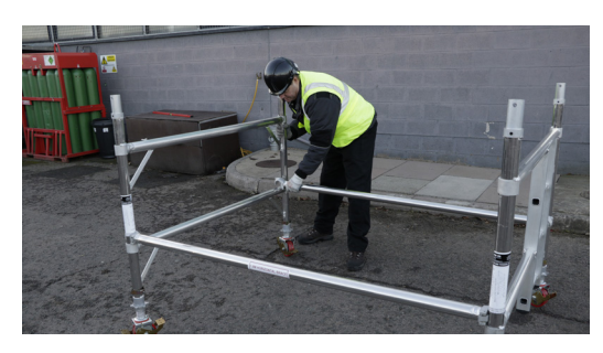
5. Fit another horizontal brace on the ladder side of the frames face down onto the 1st rung. Note: when standing inside the frames looking at the ladder frame, the ladder should be to the left hand side.

(Integral ladder must be on the left hand side)