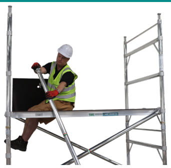
From a seated position descend down the tower to the next platform or ground. Ensure you always have collective protection around you when standing on any platform.