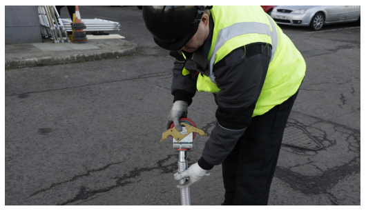
1. Insert castor wheels into adjustable legs