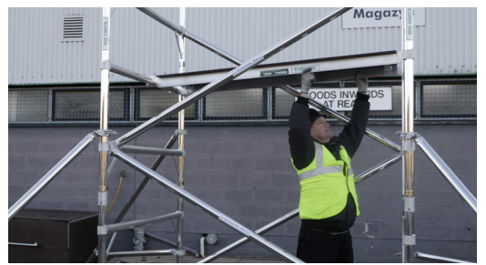
9. Fit a trapdoor platform to the 4th rung, trapdoor to the ladder end. Note: Platforms are positioned every 4 rungs.