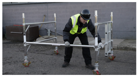
4. Fit one horizontal brace on the plain side of the frames to the vertical of the frames above the 1st rung connecting the 2 frames together.

(Integral ladder must be on the left hand side)