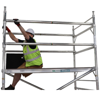
From a seated position remove 4 x guardrails making sure you never stand on an unprotected platform.