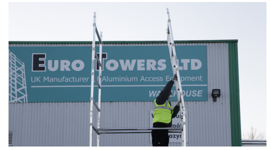
11. Standing on the platform, add a set of 4 rung frames, ladders run in a continuous pattern.