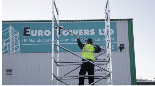
12. Add diagonal braces continuing the pattern from the previously fitted braces. Note: The odd diagonal brace is fitted to the side nearest the ladder. Repeat steps until working height is achieved.