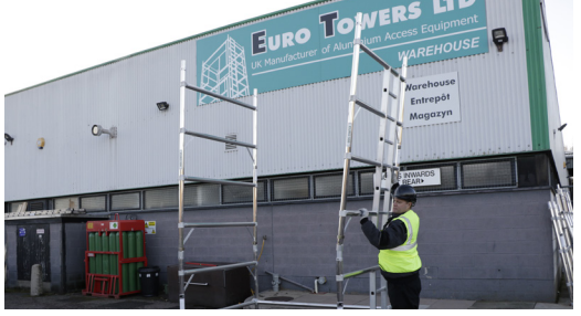
6. Fit the next set of frames onto the base, ladder frames run continuously up the left hand side. Note: see kitting page for frame lists.