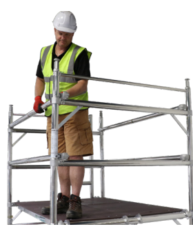
Unclip 4 x Horizontal braces from the far end of the trapdoor platform.