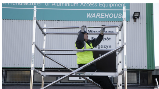
10.Climb the ladder inside the tower and sitting through the trapdoor fit 4 horizontal braces face down onto the 1st and 2nd rung above the platform to form your guardrails, as shown.