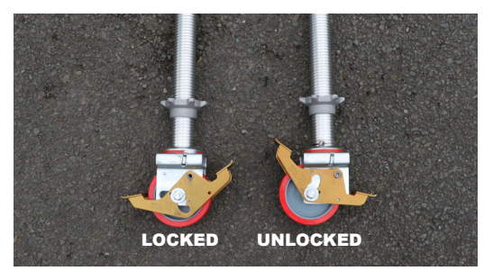
3. Lock Brakes and allow 3" thread from bottom of castor for levelling