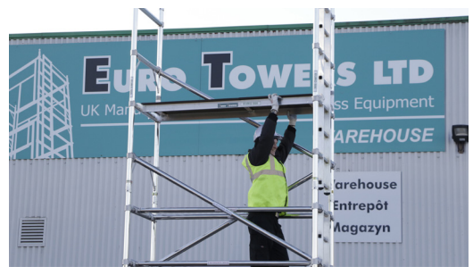
13. Fit the trapdoor platform 4 rungs above the one you are standing on. Note: There must always be 2 rungs clear above any platform so you can fit safe guardrail braces.