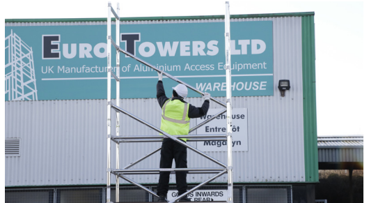
12. Add diagonal braces continuing the pattern from the previously fitted braces. Note: The odd diagonal brace is fitted to the side nearest the ladder. Repeat steps until working height is achieved.