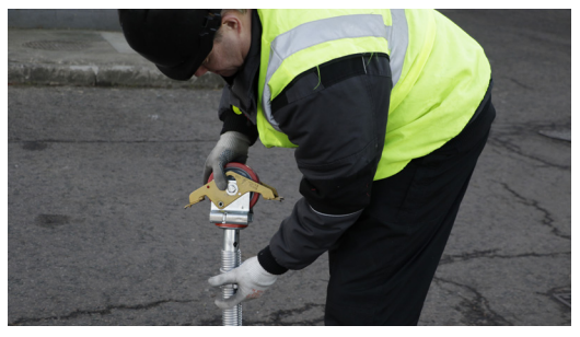
1. Insert castor wheels into adjustable legs