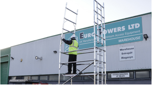
11. Standing on the platform, add a set of 4 rung frames, ladders run in a continuous pattern.