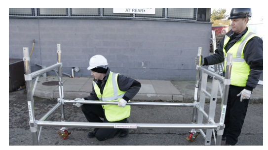
5. Fit another horizontal brace on the ladder side of the frames face down onto the 1st rung.