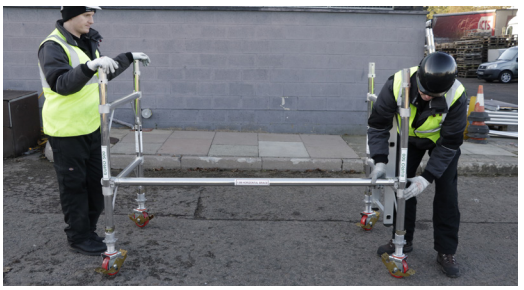
4. Fit one horizontal brace on the plain side of the frames to the vertical of the frames above the 1st rung connecting the 2 frames together.