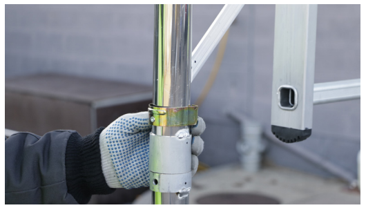
6. Ensure you interlock clips are engaged.