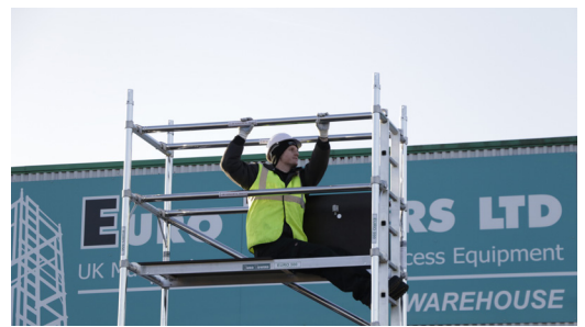
14. Climb the ladder inside the tower and sitting through the trapdoor fit 4 horizontal braces face down onto the 1st and 2nd rung above the platforms to form your guardrails as shown.