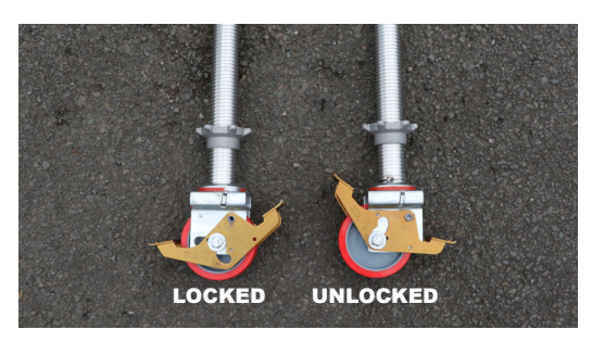
3. Lock Brakes and allow 3" thread from bottom of castor for levelling