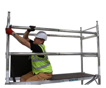
From a seated position remove 4 x guardrails making sure you never stand on an unprotected platform.