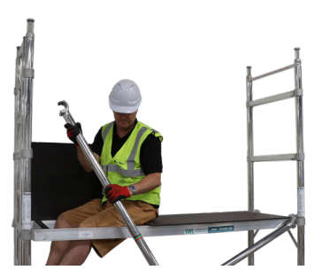
From a seated position descend down the tower to the next platform or ground. Ensure you always have collective protection around you when standing on any platform.