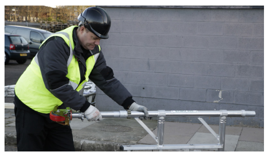
2. Insert 2 legs and castors into each 2 rung frame.